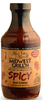
NET WT 18.6 OZ

Spicy Premium BBQ Sauce has a habanero heat without compromising flavor. Not just for wings, but for all soon-to-be spicy things.