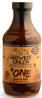
NET WT 18 OZ

Mad Dog & Merrill MIDWEST GRILL'N MadDogandMerrill.com