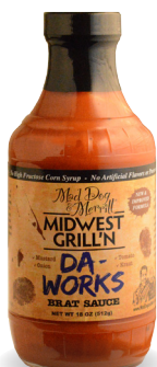
NET WT 18 OZ

Da-Works Premium Brat Sauce has the convenience of fresh vine ripe tomato, minced onion, Midwest sauerkraut and flavorful mustard.