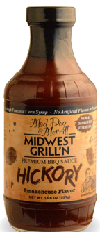
NET WT 18.6 OZ

Hickory Premium BBQ Sauce enhances beef, pork or poultry without spending time and money on a BBQ Smoker. Truly a robust hickory rich flavor.